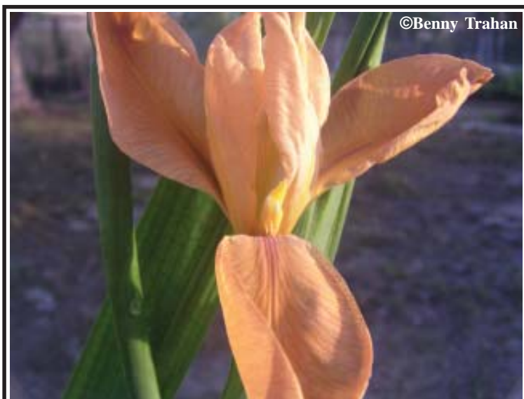
The color of the author's I. nelsonii as it opened