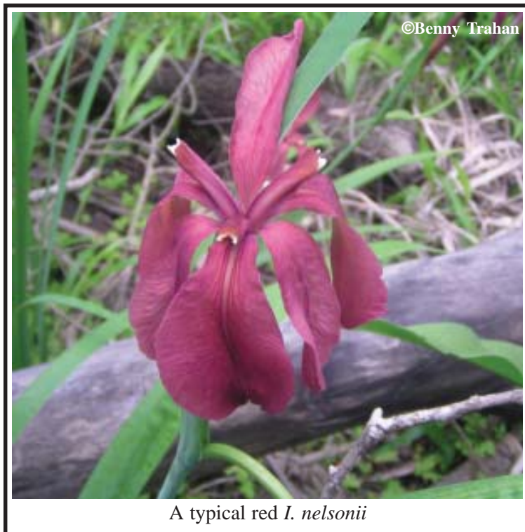
A typical red I. nelsonii