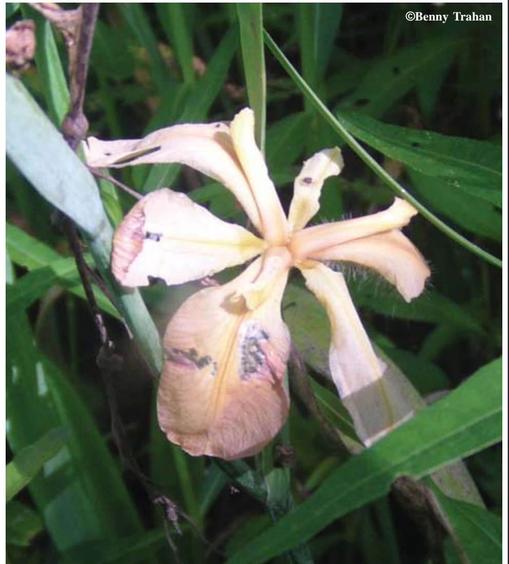
An I. nelsonii that the author thought could be pink or yellow

Well this year, 2008, the long wait was over. The color on the first bud appeared and to my disappointment, it was as red as any nelsonii I had ever seen. Two days later I noticed the bud was a little lighter, almost orange and the next day it was a lighter orange and when it